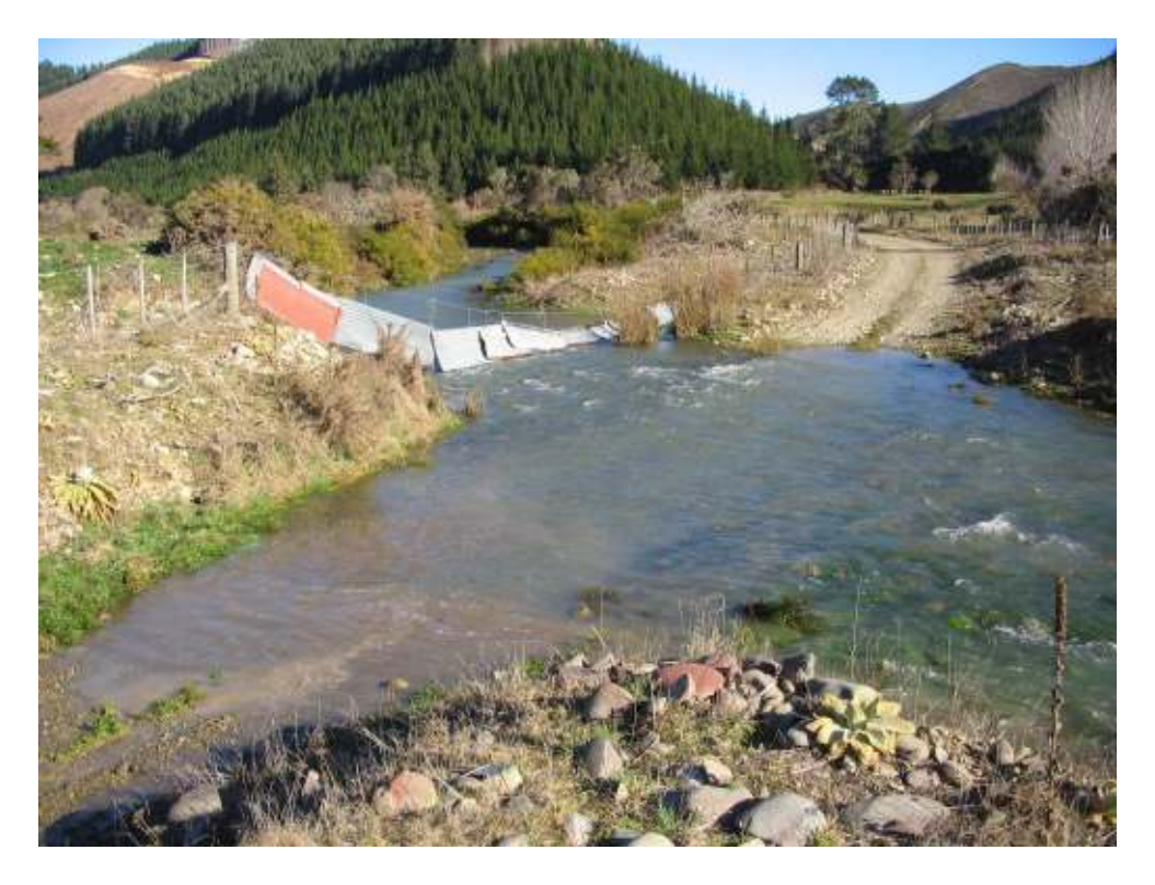
Ford across the Stanley Brook on Bridgemans Road, shortly after heavy rain