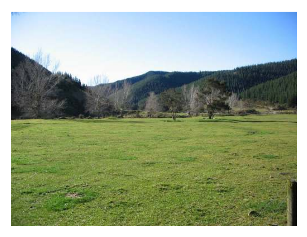
The site from Bridgemans Road, at the entrance, looking north

Project Fusion has put together a concept design which has been refined and updated as input and feedback has been received back from effected parties, key stakeholders and potential user groups. We have also provided an outline of the services required, all of which is covered in Section 3. As a result of feedback from effected parties, key stakeholders and user groups we have extended the report scope to include a section on how the organizational structure of such a facility could be established, which is covered in Section 4. We have provided a basic cost estimate in Section 5. We cover the likely town planning issues in Section 6 and how the proposed design fits within the objectives, policies and rules of the Tasman Resource Management Plan. We then conducted a series of presentations and meetings with the likely affected parties to the proposed motorsport park. The issues, concerns and ideas that came out of those meetings and discussions are included in Section 7. We also ran a series of presentations, meetings and discussions with potential user groups and other stakeholders, again recording their views, which is outlined in Section 8. Finally, in Section 9, we have outlined the next steps required to take the project through to attaining the necessary resource consents, being the next major milestone in the process of creating a motorsport park for the Tasman Region.