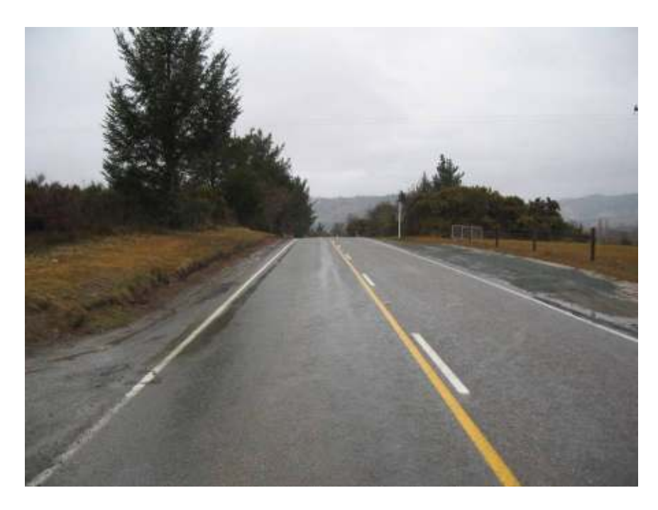
Motueka Valley Highway & Olivers Road intersection looking south

The Traffic Report would also cover the other areas of section 16.2 in terms of carparking, loading and gates.