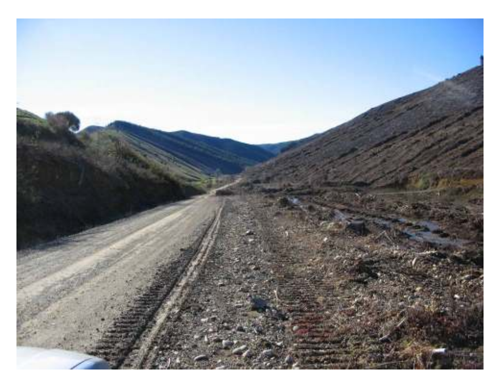
The present access road descending into Rabbit Gully, looking north

The new access road to be designed to normal council roading standards and have appropriate setbacks from forestry plantations, with a managed fire-break on either side of the access road throughout the entire length.