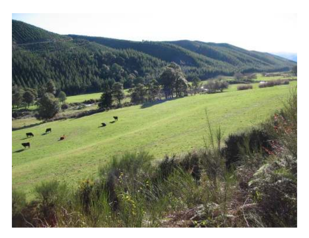
The site of the Proposed Motorsport Park looking north west

As with any sport whether its rugby, rowing or motorsport, to produce sports competitors at the top of the pyramid there always needs to be a large base of basic competitors with facilities to regularly compete. While most other sports facilities and available grounds are being improved and developed in the Nelson / Tasman region the reverse is happening for motorsport. Urban growth, the faster modern life style, environmental awareness, accountability for public safety have all seen the availability of part time venues all but disappear (road closures for the once annual Nelson Car Club hill climbs on the likes of Kerrs and Sandy Bay Hills are prime examples). While permanent tracks like the Speedway and Go-Karts have come under various barrages of complaints from the newer urban settlers.